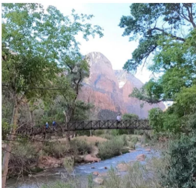
THE VIRGIN RIVER

In 2021, over 5 million people visited Zion National Park and 2022 is on track to match these numbers. From muscular rock formations and jagged peaks to the verdant canyon areas along the Virgin River, Zion has something for everyone. Whether you seek the thrills of hiking Angels Landing or the more serene Emerald Pools area or adventuring up through the narrows you will find something to suit your desires and capabilities. At the end of the day hang out in the town of Springdale and do some shopping or just relax by the pool.